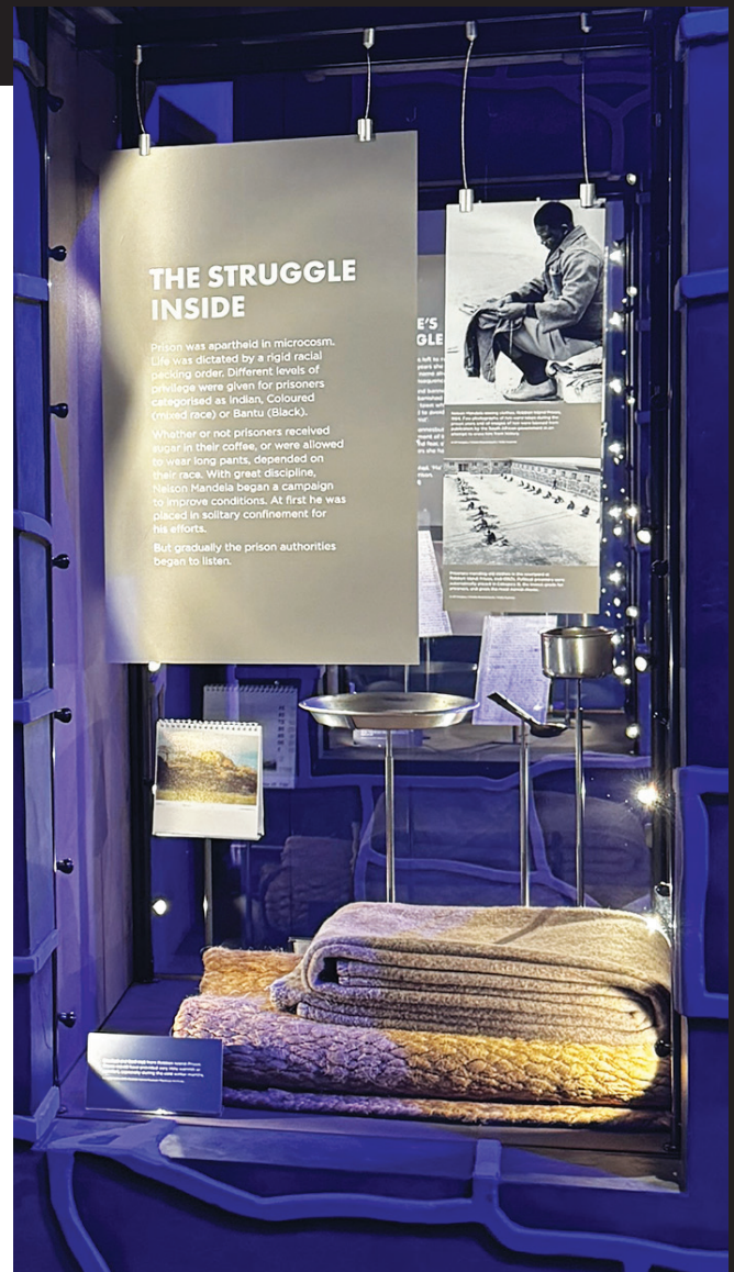
Object highlight: Blanket and bed mat from Robben Island Prison