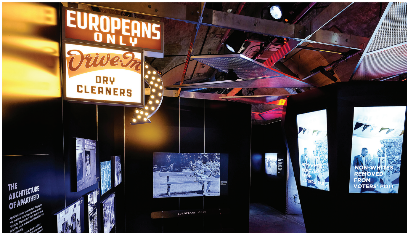
Object highlight: Original apartheid-era street signs

Note: This section of the exhibit contains images of violence.