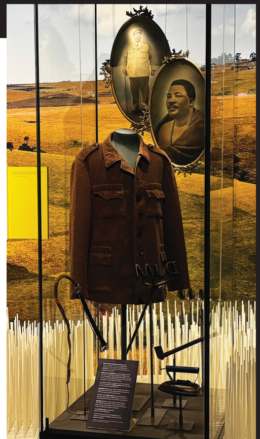
Object highlight: Objects used in Mandela's daily life

Find the sign titled "A Deeper Education." How did Mandela's early life prepare him for leadership?