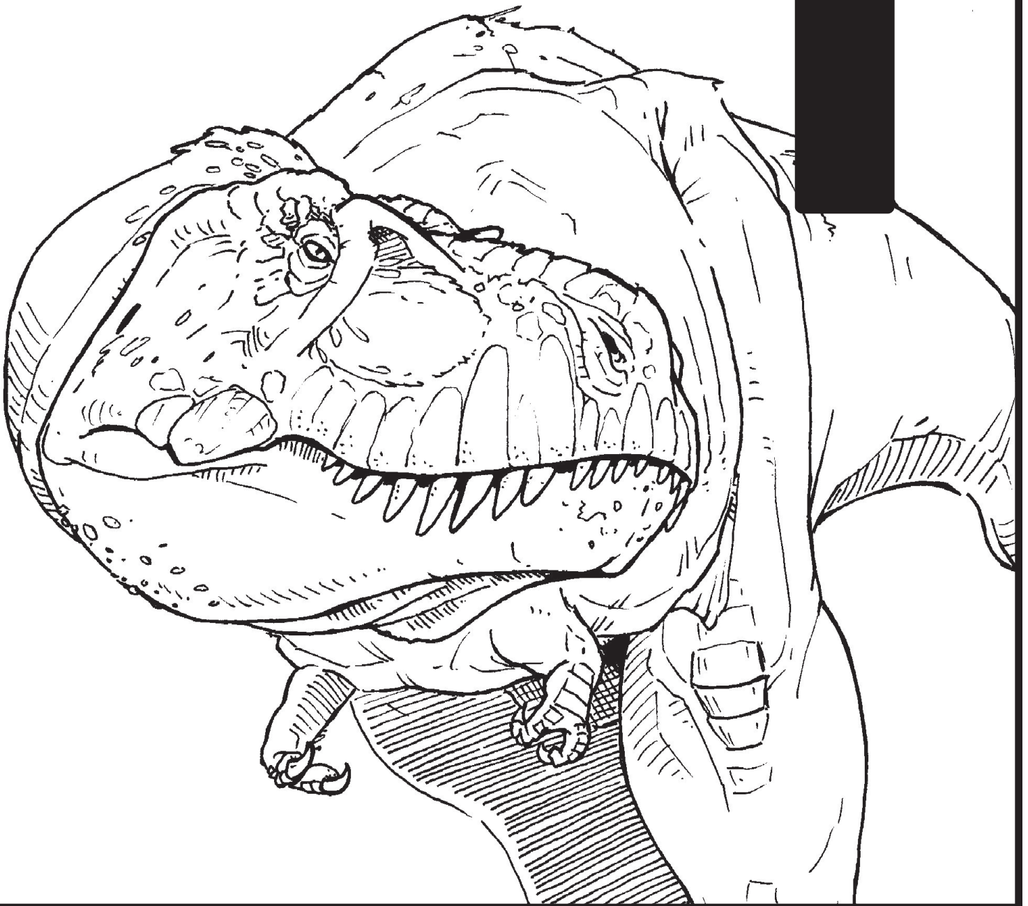
Tyrannosaurus rex tie-RAN-oh-SOR-rus rex