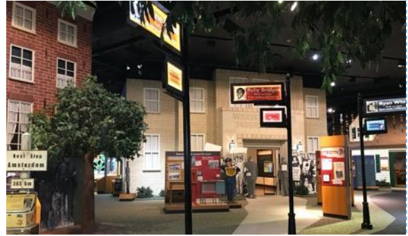
The Power of Children®