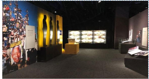
Mandela: The Official Exhibition (June 22, 2024 – Jan. 20, 2025)