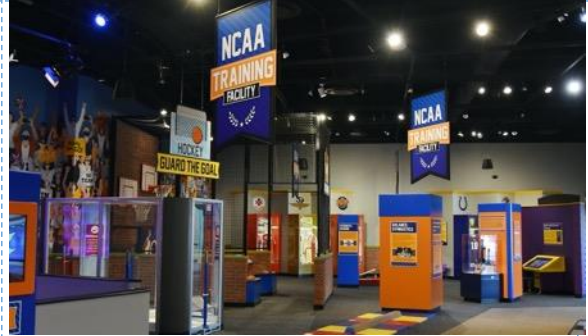
The World of Sport