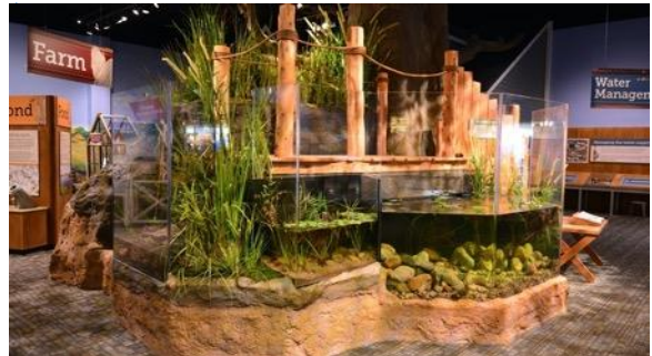
Corteva Agriscience ScienceWorks