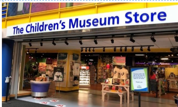
The Museum Store