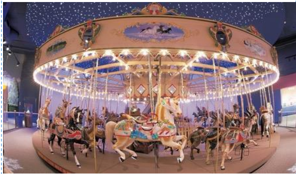
Carousel Wishes and Dreams