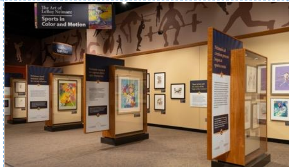
National Art Museum of Sport