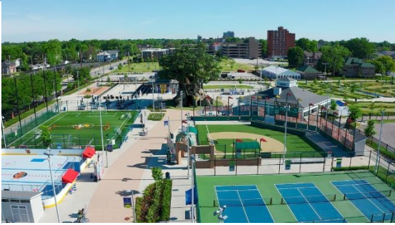
Riley Children's Health Sports Legends Experience® (Closing for the season Nov. 3, 2024)