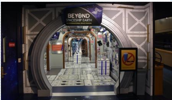
Beyond Spaceship Earth