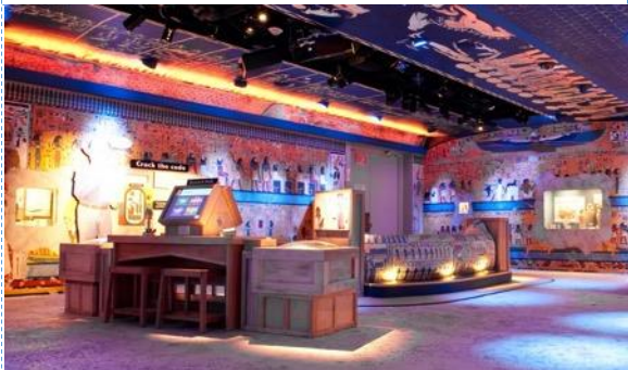
Treasures of the Earth