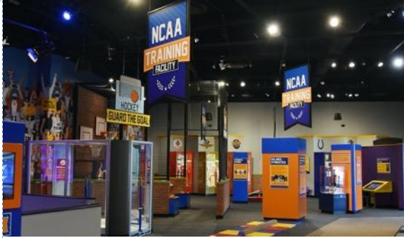
World of Sport