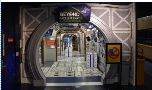
Beyond Spaceship Earth