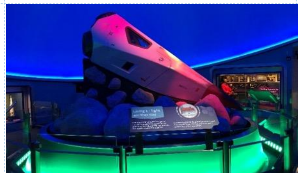
Space Object Theater