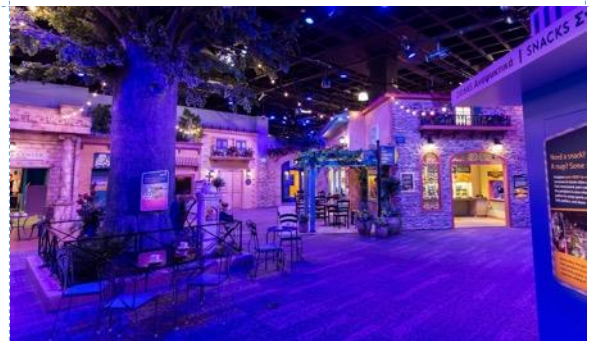
Take Me There: Greece