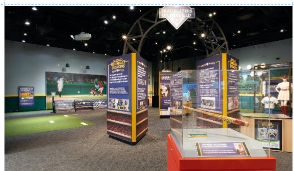
Baseball Boundary Breakers