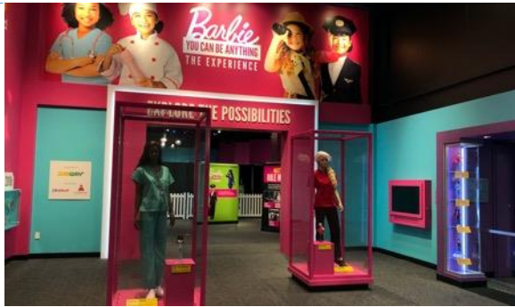
Barbie You Can Be Anything