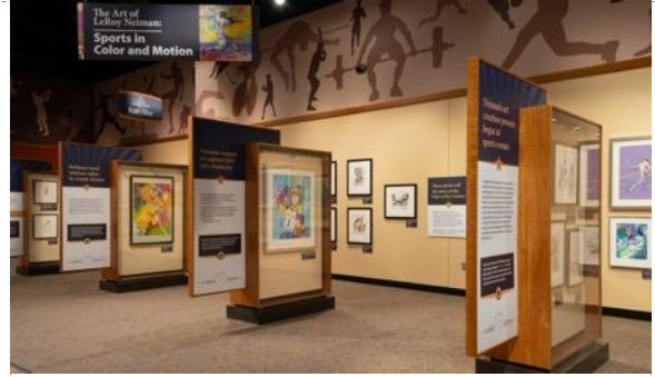
Nat'l Art Museum of Sport