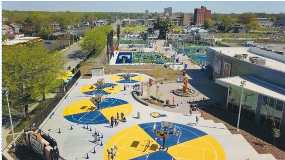
Riley Children's Health Sports Legends Experience

Special Exhibits: Please see childrensmuseum.org/exhibits for current offerings