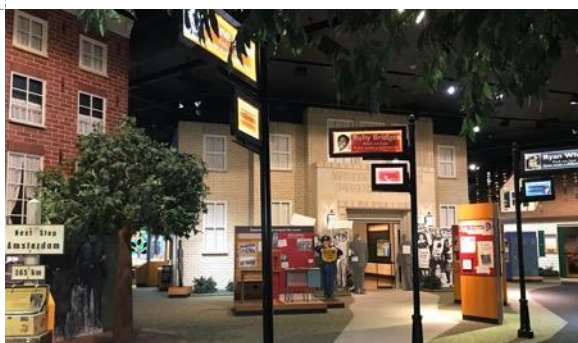
The Power of Children