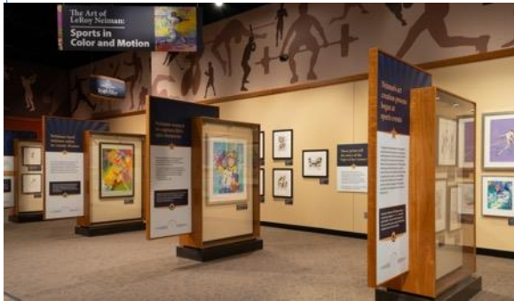
National Art Museum of Sport