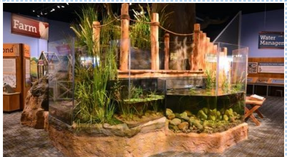
Corteva Agriscience ScienceWorks