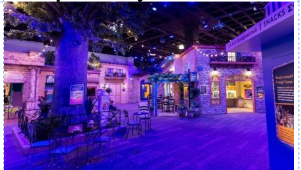
Take Me There®: Greece (Exhibit closes Sept. 15, 2024)