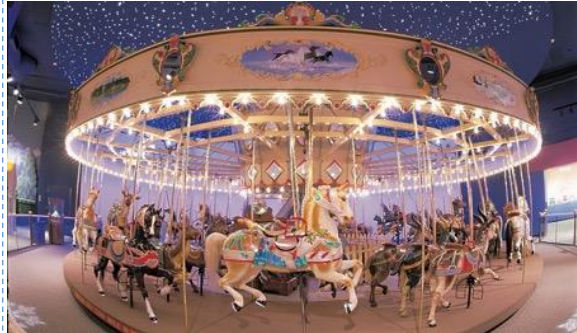
Carousel Wishes and Dreams (Closed for Maintenance Aug. 26- Sept. 27)