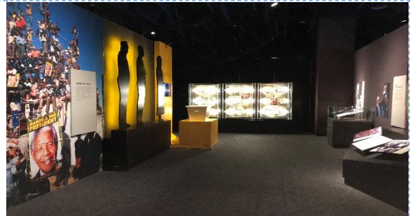
Mandela: The Official Exhibition (June 22, 2024 – Jan. 20, 2025)