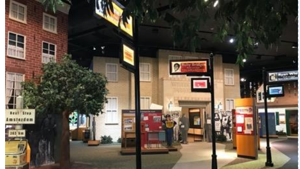
The Power of Children®