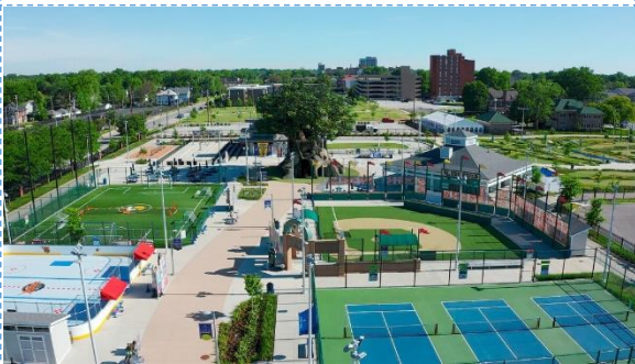
Riley Children's Health Sports Legends Experience®