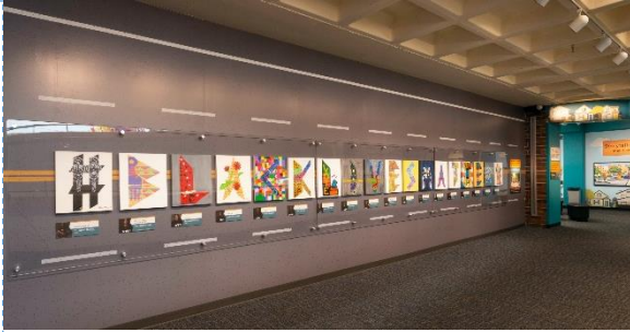
Stories From Our Community: The Art of Protest