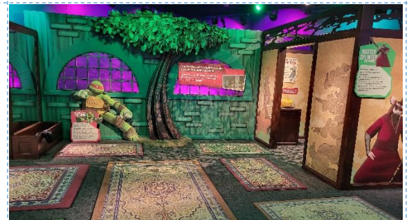
Nickelodeon's Teenage Mutant Ninja Turtles™: Secrets of the Sewer™ (March 9 – Sept. 2, 2024)