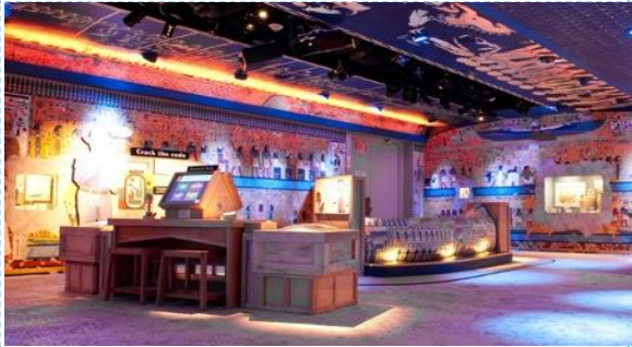
National Geographic Treasures of the Earth