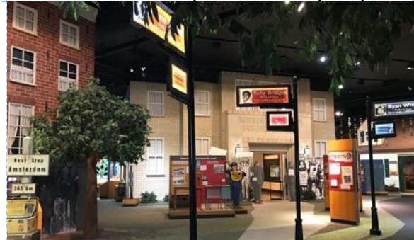
The Power of Children®