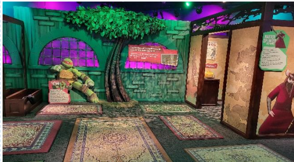
Teenage Mutant Ninja Turtles™: Secrets of the Sewer™ (March 9 – Sept 2)