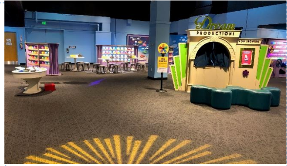
Emotions at Play with Pixar's Inside Out (Feb 3 – May 19)