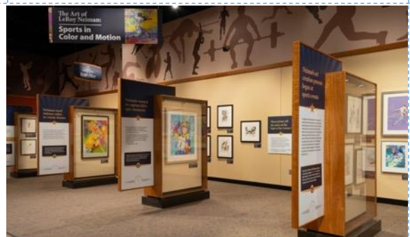
National Art Museum of Sport