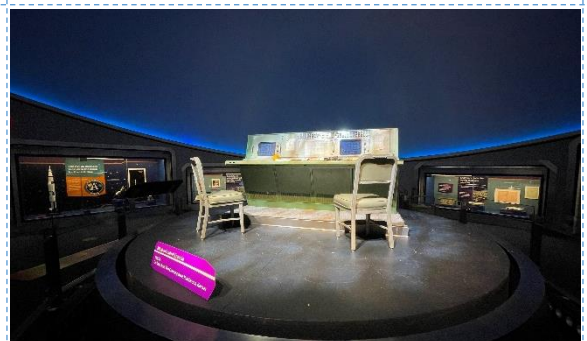
Space Object Theater