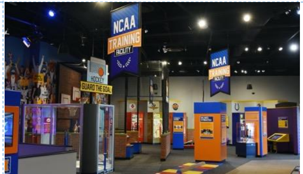
World of Sport