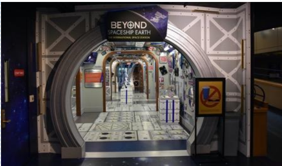
Beyond Spaceship Earth