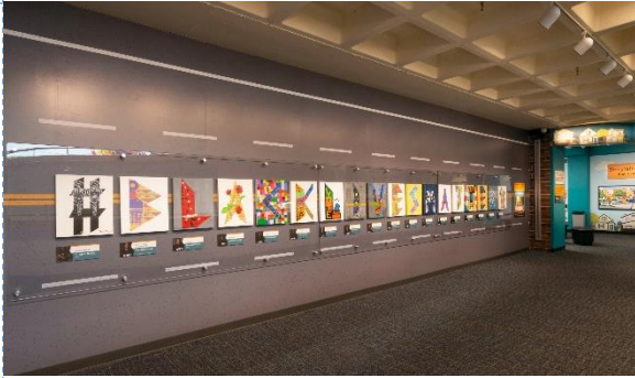
Stories From Our Community: The Art of Protest