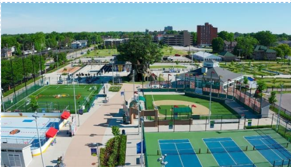
Riley Children's Health Sports Legends Experience