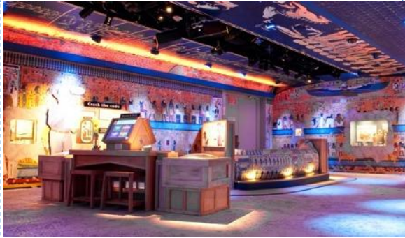
Treasures of the Earth