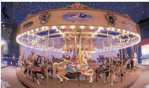
Carousel Wishes & Dreams