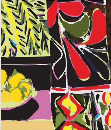
Detail from a mixed media collage by Henri Matisse.