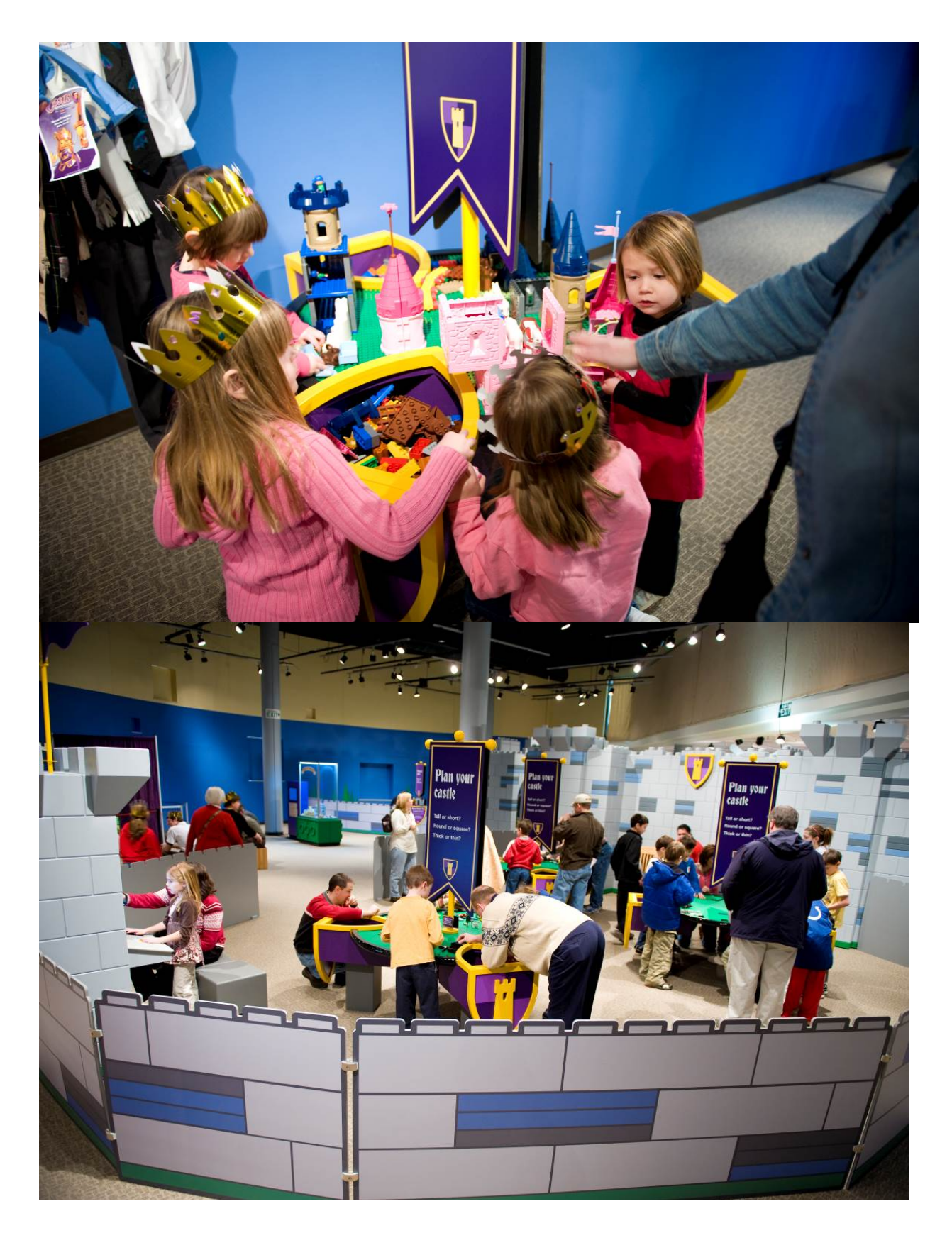
Castle Builder The Children's Museum of Indianapolis