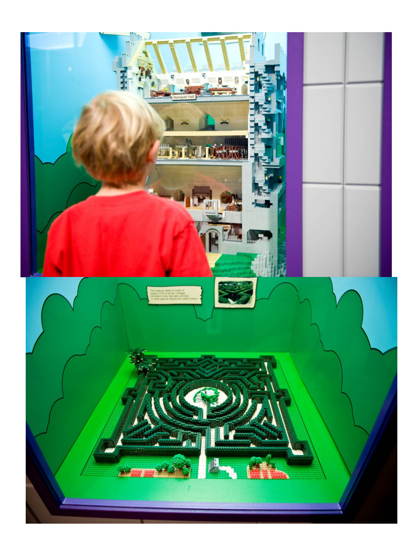
Castle Builder The Children's Museum of Indianapolis