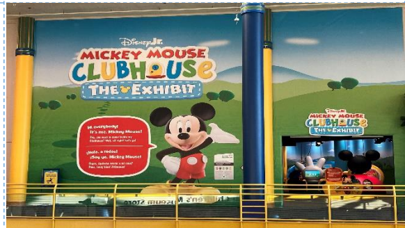
Mickey Mouse Clubhouse: The Exhibit (Feb. 22 – Sept. 1, 2025)