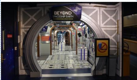
Beyond Spaceship Earth