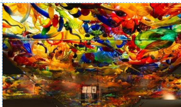
Fireworks of Glass