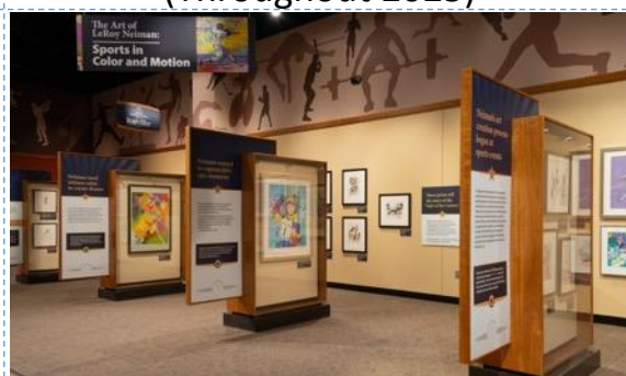
National Art Museum of Sport