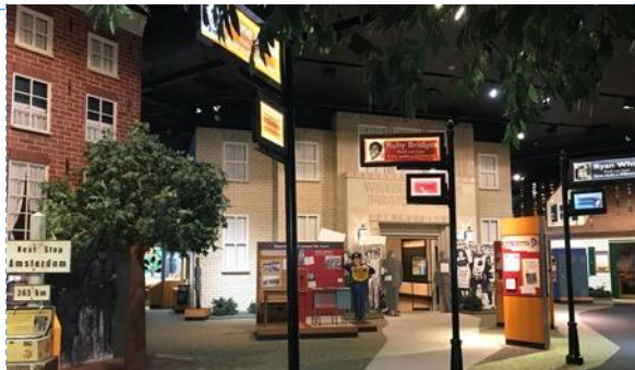
The Power of Children®