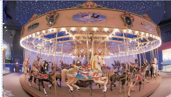
Carousel Wishes and Dreams