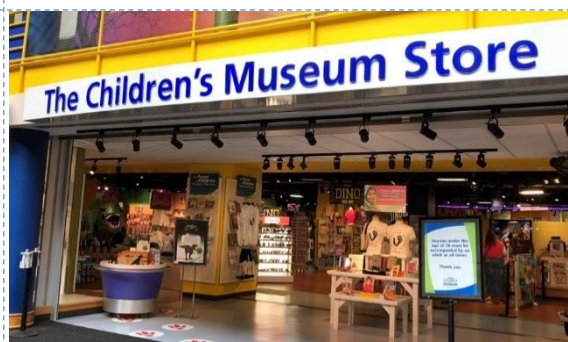
The Museum Store