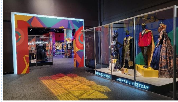
Ruth E. Carter: Afrofuturism in Costume Design (March 22 – Sept 7, 2025)