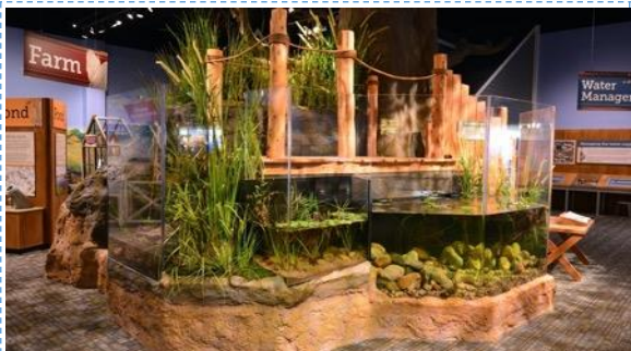
Corteva Agriscience ScienceWorks