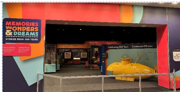
Memories, Wonders, and Dreams: Stories from 100 years (Throughout 2025)