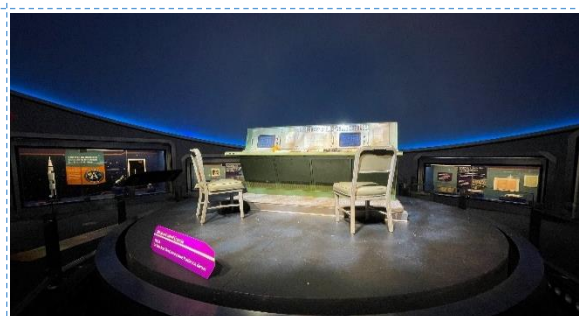
Schaefer Planetarium and Space Object Theater