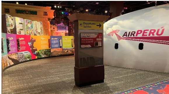
Take Me There®: Peru