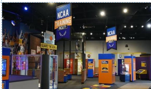
The World of Sport