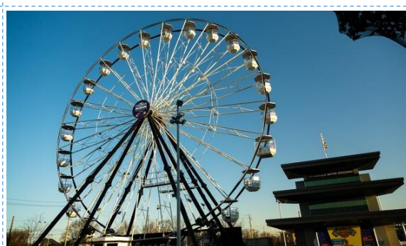
Centennial Ferris Wheel (March 15 – Nov 2, 2025)