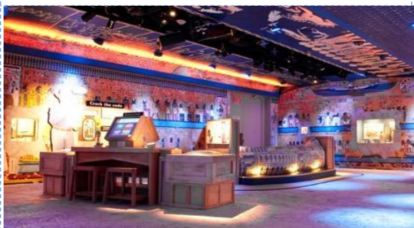
National Geographic Treasures of the Earth