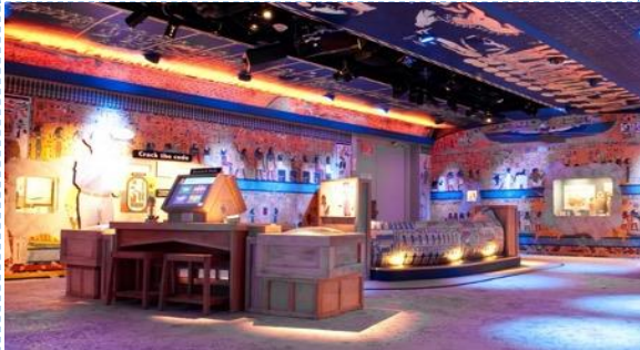
National Geographic Treasures of the Earth