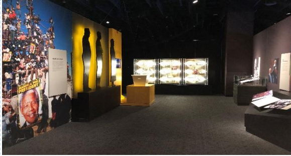
Mandela: The Official Exhibition (June 22, 2024 – Jan. 20, 2025)