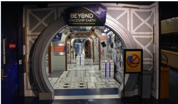
Beyond Spaceship Earth