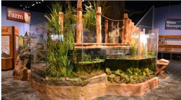
Corteva Agriscience ScienceWorks