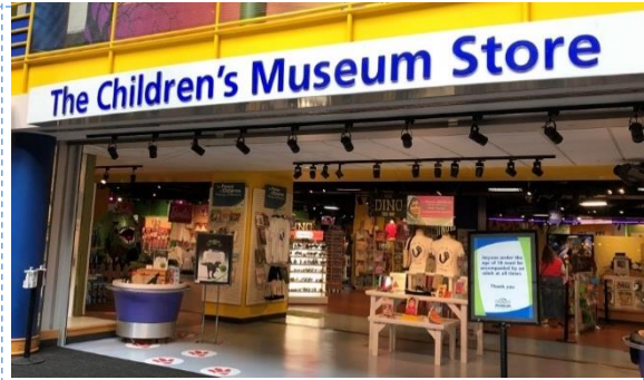
The Museum Store