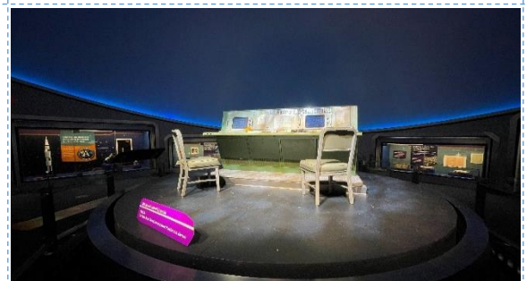
Schaefer Planetarium and Space Object Theater