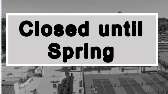
Outdoor Riley Children's Health Sports Legends Experience®