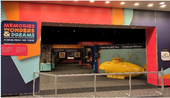
Memories, Wonders, and Dreams: Stories from 100 years