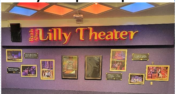
Lilly Theater (Check website for performance dates and times)