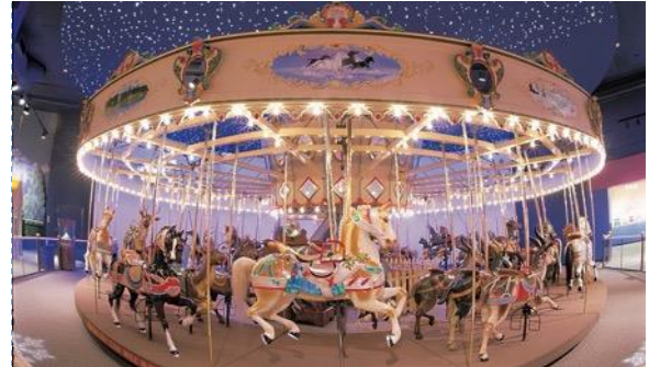
Carousel Wishes and Dreams