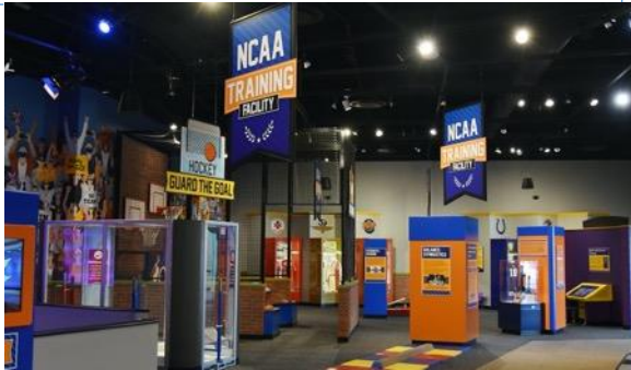
The World of Sport