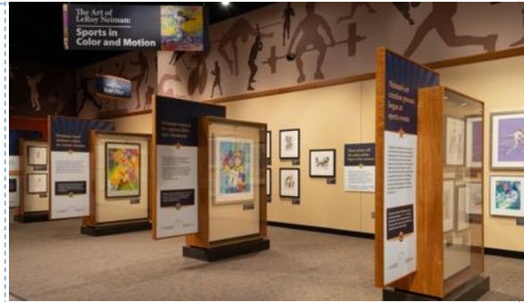
National Art Museum of Sport