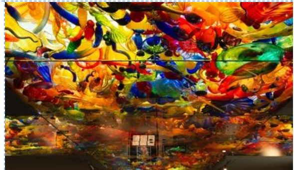
Fireworks of Glass