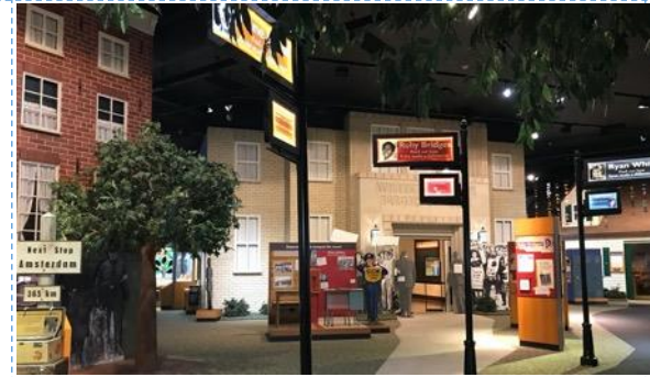
The Power of Children®